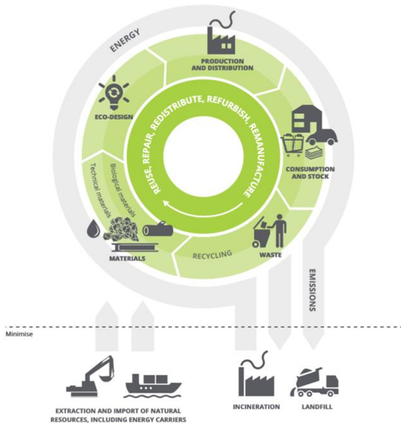
Image 18.1: A Simplified Model of the Circular Economy for Materials and Energy (European Environment Agency (EEA) 2016)

The principal objective of sustainable resource and waste management is to use resources more efficiently, where the value of products, material and resources is maintained in the economy for as long as possible such that the generation of waste is minimised. To achieve resource efficiency there is a need to move from a traditional linear economy to a circular economy (refer to Image 18.1).