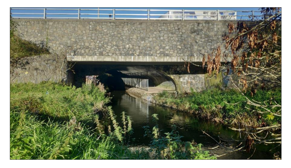
Plate 3.1 Representative image of site T1 on the River Tolka (facing upstream towards culvert)