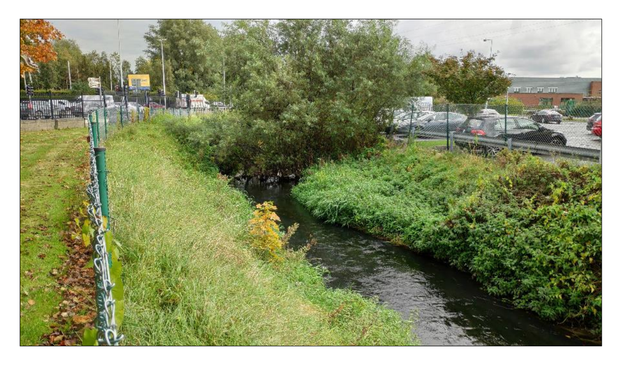
Plate 3.10 Representative image of site C2 on the River Camac (upstream of the culvert)

The presence of a healthy Annex II white-clawed crayfish population, in addition to excellent brown trout habitat and good lamprey habitat summarizes the key habitats found at this site.