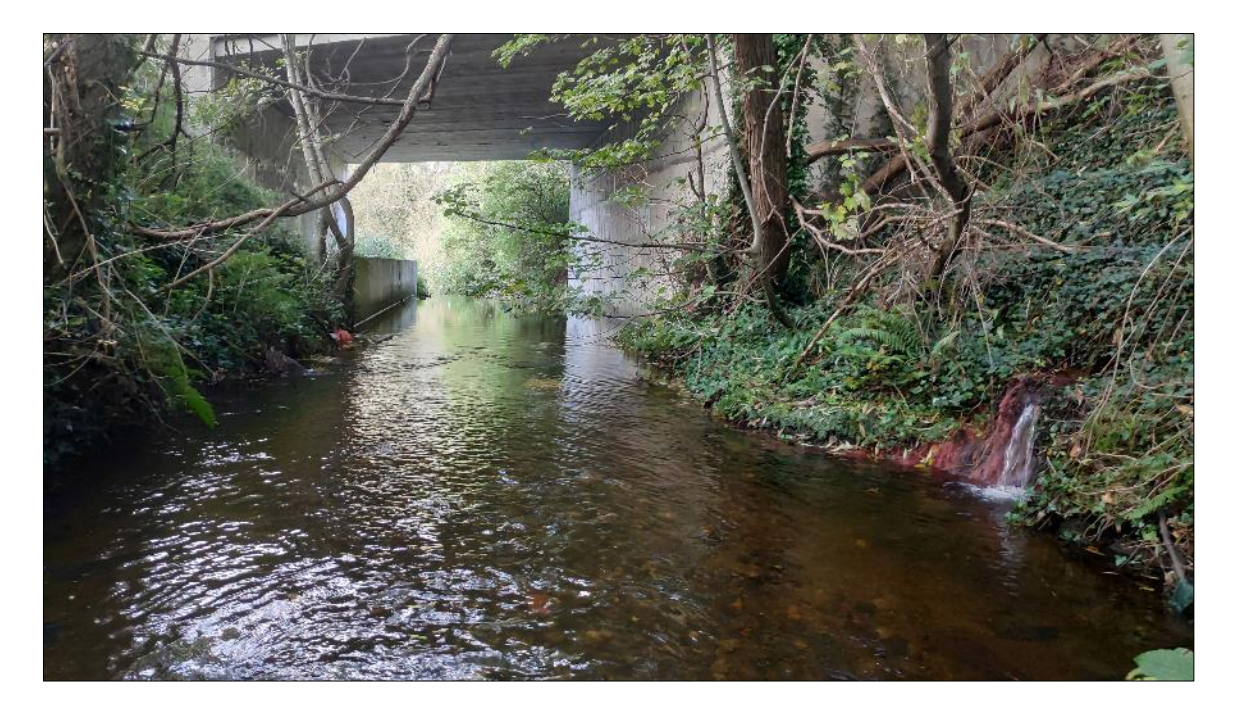
Plate 3.6 Representative image of site O2 on the Owendoher River (facing downstream towards road bridge with point source evident in right foreground)