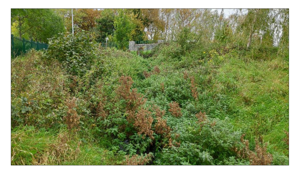
Plate 3.12 Representative image of site P1 on the upper reaches of the River Poddle (heavily scrubbed-over, facing upstream to road crossing)