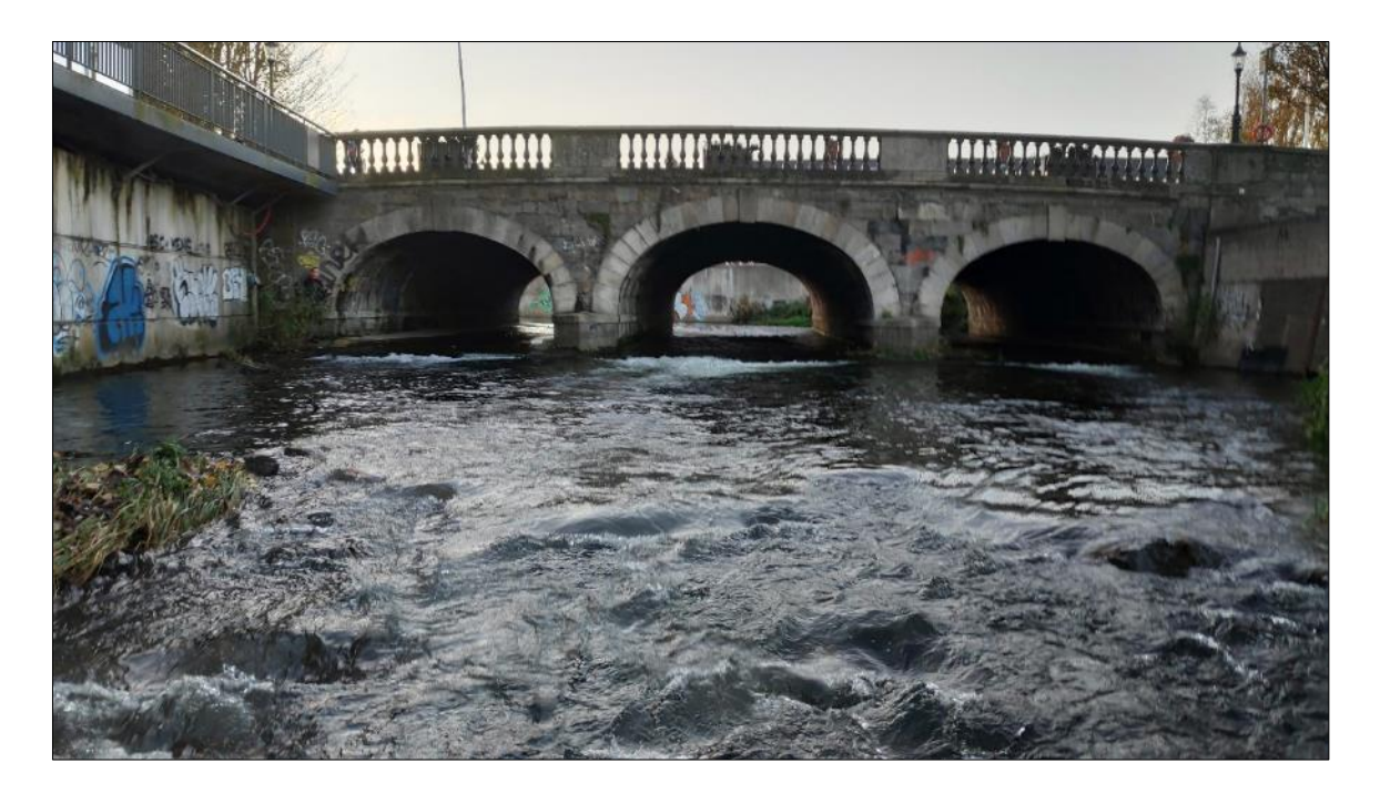
Plate 3.3 Representative image of site T3 on the River Tolka at Frank Flood Bridge (facing upstream)