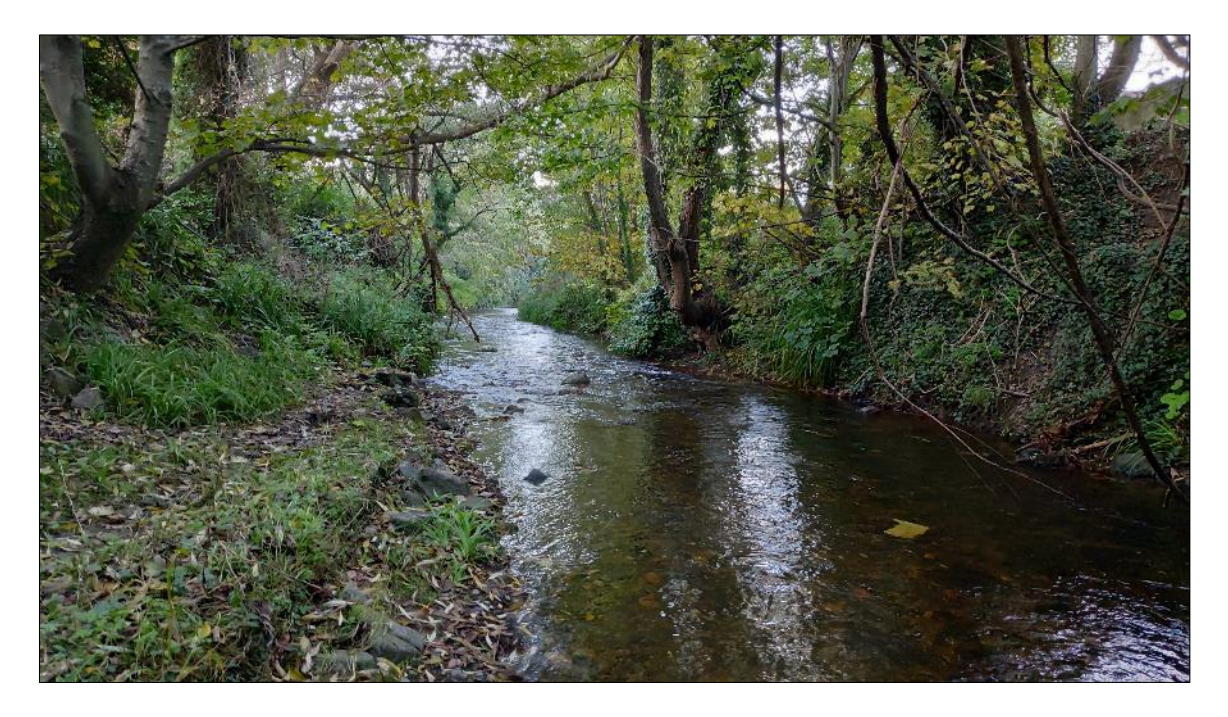
Plate 3.7 Representative image of site O3 on the Owendoher River (facing downstream)

In summary, site O3 showed excellent salmonid habitat with good habitat in particular. Additionally, habitat with high otter potential (including a possible breeding area) was also noted.