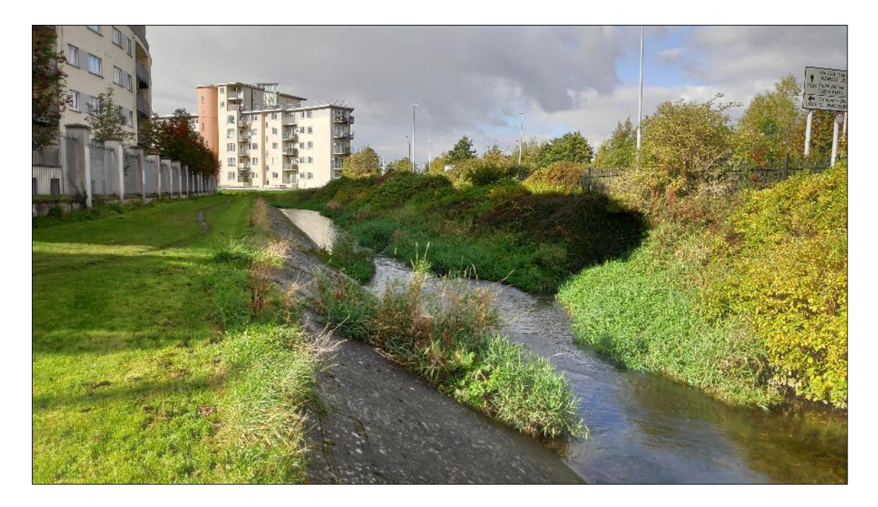
Plate 3.9 Representative image of site C1 on the River Camac (facing upstream)