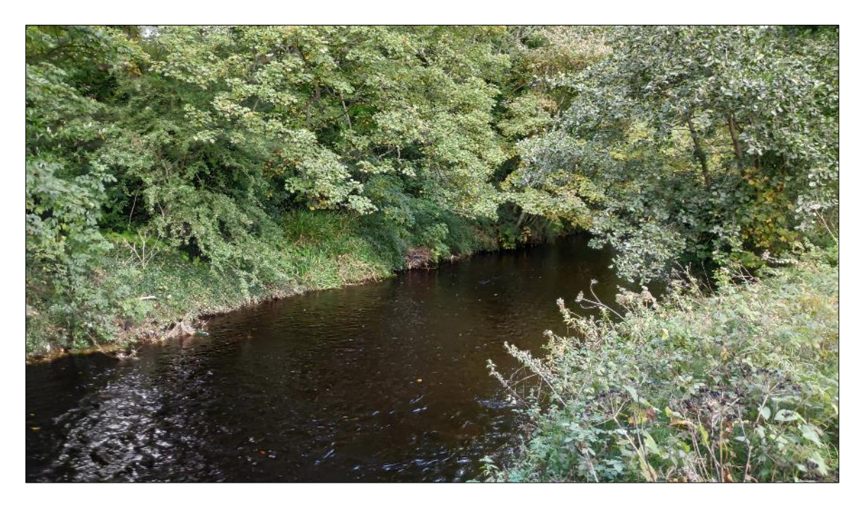
Plate 3.8 Representative image of site D1 on the River Dodder at Rathdown Park

In summary, given the excellent salmonid habitat - in particular spawning gravel, with other areas of good quality nursery and holding habitat observed at this site. Otter activity was not seen at this site during survey, but it is thought that habitat potential at this site was high for this species.