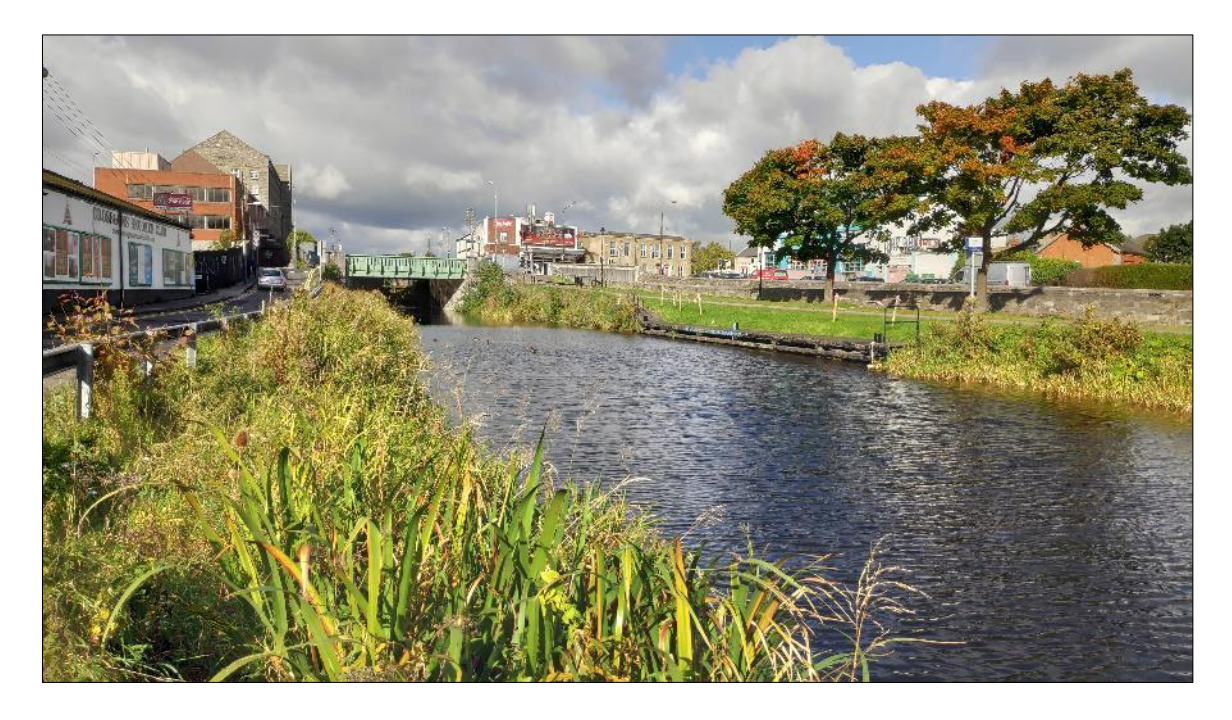
Plate 3.4 Representative image of site RC1 on the Royal Canal at Phibsborough (5<sup>th</sup> lock)

In summary, this site on the Canal and situated within the Royal Canal pNHA (002103), exhibited high coarse fish habitat, high European eel habitat, and of high quality for otter as a foraging area.