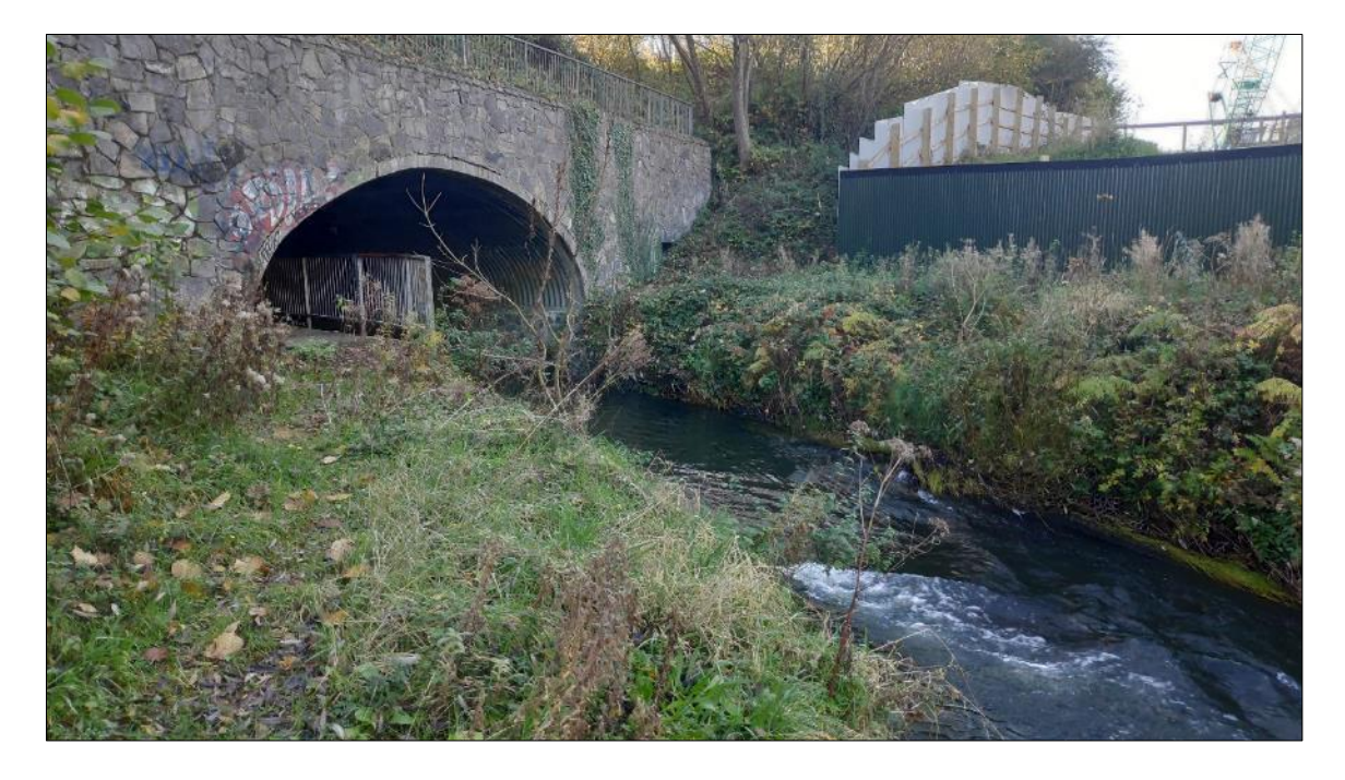
Plate 3.2 Representative image of site T2 on the River Tolka (facing upstream towards culvert)

The site T2 was found to be of moderate salmonid and European eel quality, with observable utilisation by otter.