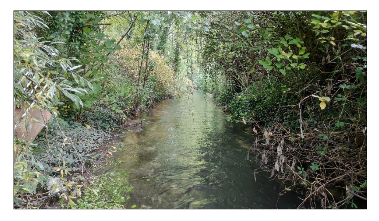
Plate 3.11 Representative image of site C2 on the River Camac (downstream of the culvert)

Plate 3.10 Representative image of site C2 on the River Camac (upstream of the culvert)